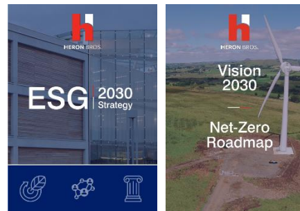
Heron Bros ESG Strategy